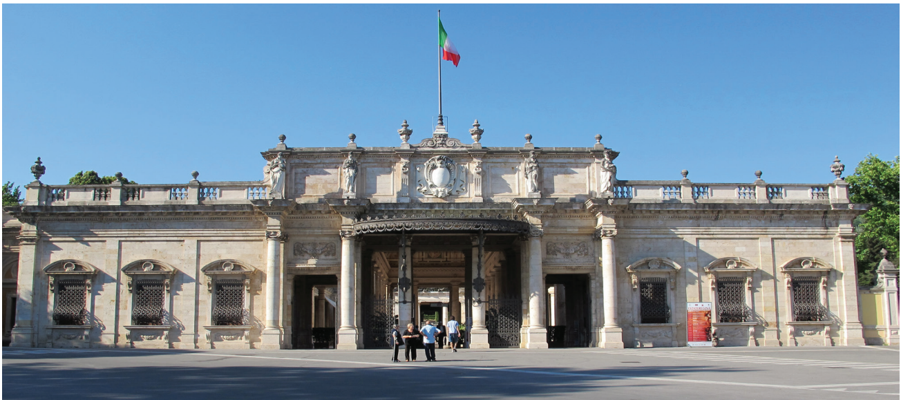
Terme del Tettuccio

Today, although not as popular as they once were, Montecatini's thermal hot springs remain an ideal destination for wellness, relaxation, and medical treatment. In addition to its renowned thermal spas, Montecatini Terme offers delicious cuisine, excellent wine, and elegant Art Nouveau and neo-Gothic palaces that frame the Thermal Park. Visitors should also visit the nearby medieval village of Montecatini Alto (the upper town), which offers a captivating glimpse of its rich history. Accessible via the world's oldest funicular