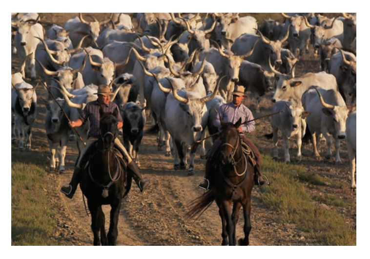
Instead of a lariat, the butteri carry the uncino – their third hand. It is a long, thin wood stick with a hook on one end and a fork on the other. It's used to open and close gates without dismounting, direct cattle, safely reach the cinch when saddling a colt, or pick up hats off the ground.

Today the Italian cowboy culture still exists. Despite the dwindling number of cattle to tend, the horseback tourism culture is growing. Just like the dude ranches