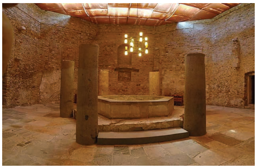
The Saint Sepulcre