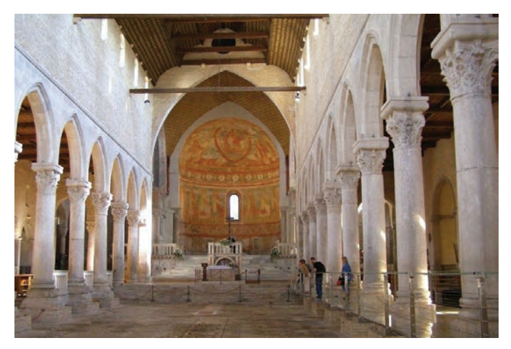
Basilica of Aquilea

the abandonment of Aquileia. However, the town was revitalized through its religious significance with the support of Charlemagne and the Holy Roman Empire. In 1077, Henry IV granted independence to the "Friuli State" with Patriarch Sigeard as its head. The patriarchs held temporal power for three centuries until 1420 when Aquileia was absorbed into the Republic of Venice. In 1445, it became part of Austria and was later annexed to Italy after the First World War, following centuries under the Austrian Empire.