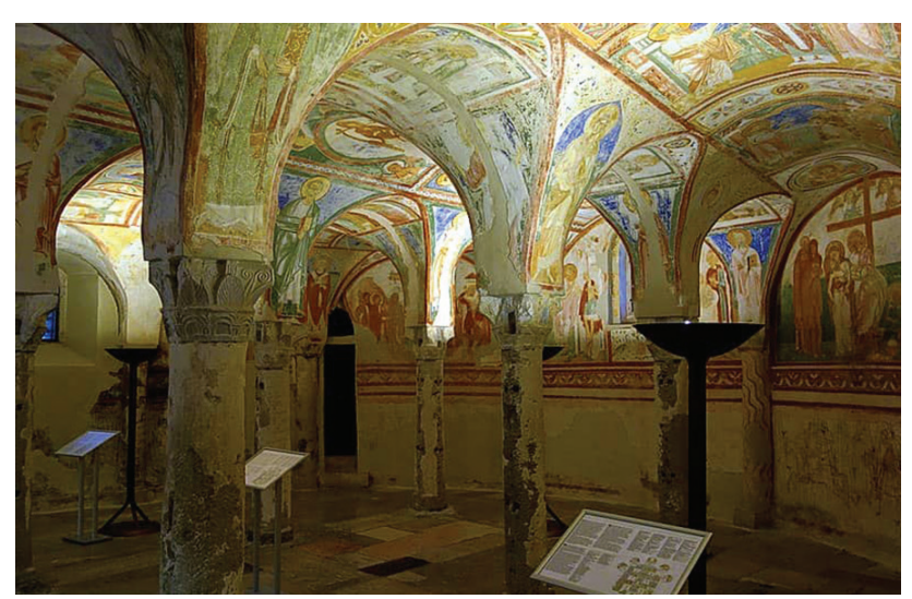
The Frescos Crypt