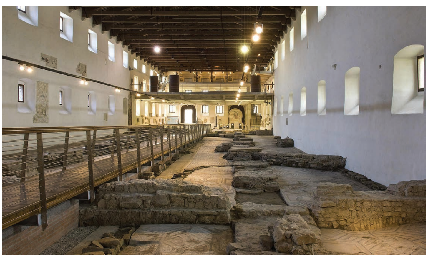
Early Christian Museum