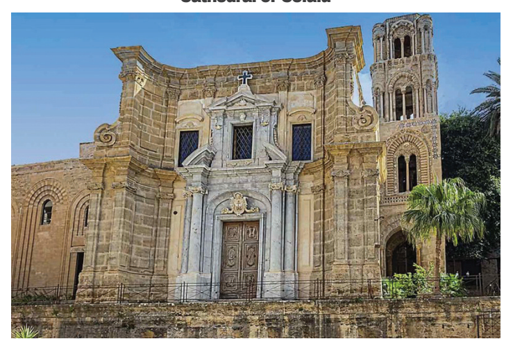
The Church of Santa Maria dell'Ammiraglio