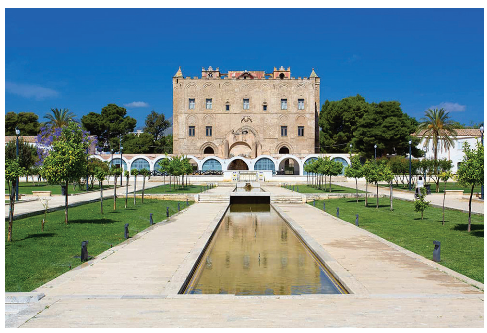
Palazzo della Zisa

themselves to rest and entertainment. The Palace is also linked to an extraordinary legend, that of the devils of Zisa.