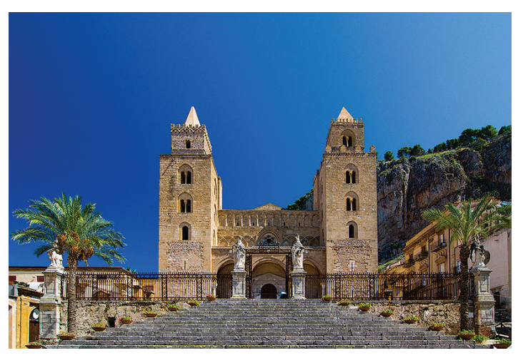
Cathedral of Cefalù