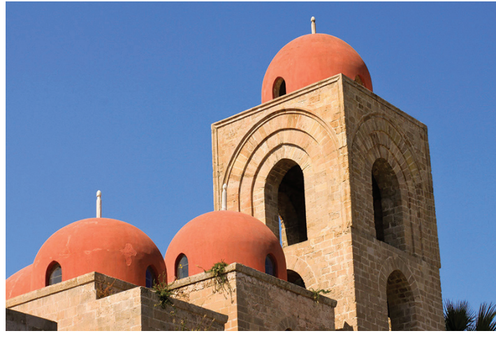
San Giovanni Degli Eremiti