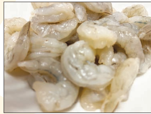
Plate it and serve.