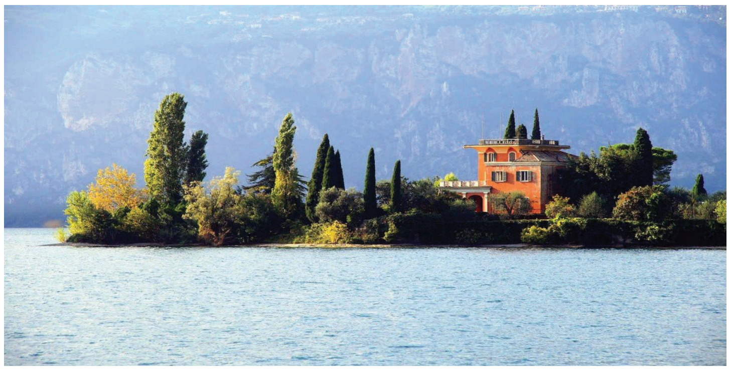
Isola del Sogno

On the Venetian shore of Lake Garda, located right in front of Malcesine, is a small island still considered "wild". Nature has remained uncontaminated on this small and non-habitable rocky outcrop that is 98 meters long and 40 meters wide. The island takes its name from the abundant presence of olive trees. It is located near the other small islands around Malcesine, Isola del Sogno (Dream Island), and Trimelone Island. Isola dell'Olivo is best known as a hub/ nautical reference for