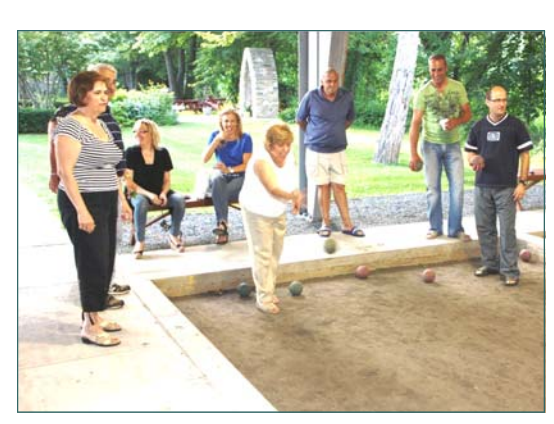
A fun game of bocce with family and friends