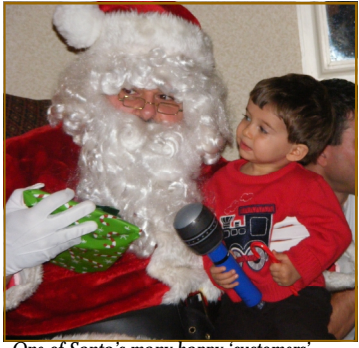
One of Santa's many happy 'customers'

frightful, the predicted bad weather held off. IACC members, along with their family and friends, enjoyed an afternoon of good food, company, music, caroling and camaraderie, and most important of all, a visit from Santa! Everyone enjoyed the lunch buffet