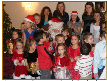
Santa poses for a group photo before heading to the North Pole

and pizza party. Thanks to the Mallozzi's, we were treated to decorate-your-own gingerbread cookies from Villa Italia and a most welcoming hot chocolate station. There was certainly something for everyone! The afternoon was filled with activity including the kid crafts, the non-stop entertainment by Ernie the DJ, and this year's caroling