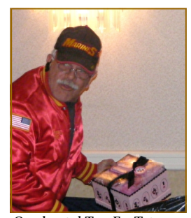
Our donated Toys For Tots are picked up by Marines