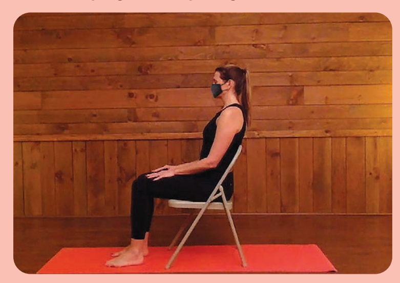
Chair Yoga is a gentle form of yoga that is practiced sitting in a chair or standing using the chair for support. Remember to wear loose comfortable clothing!

This course is great for people wanting to reclaim healthy movement, build strength and joint mobility, and regain your best body regardless of your age and fitness level!