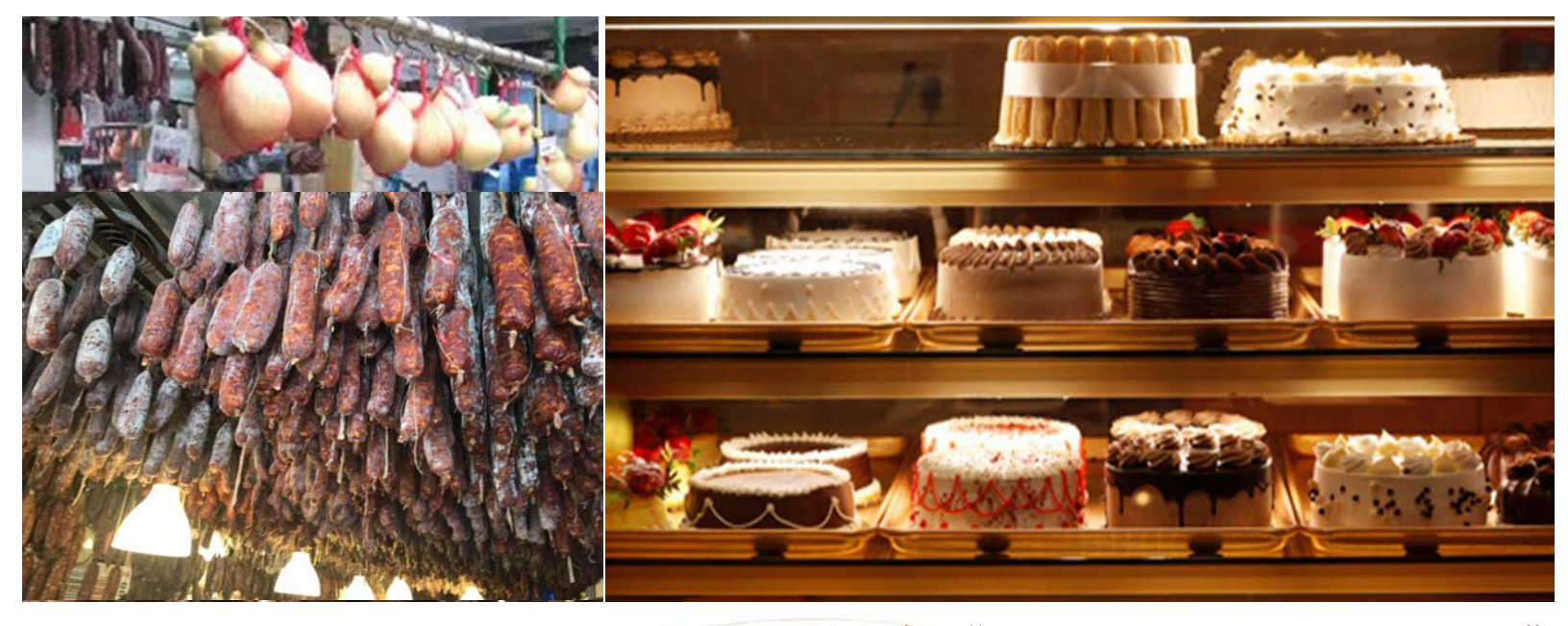
EXPERIENCE NEW YORK CITY'S "REAL LITTLE ITALY" Join Us On Our Annual Bus Trip To Arthur Avenue!