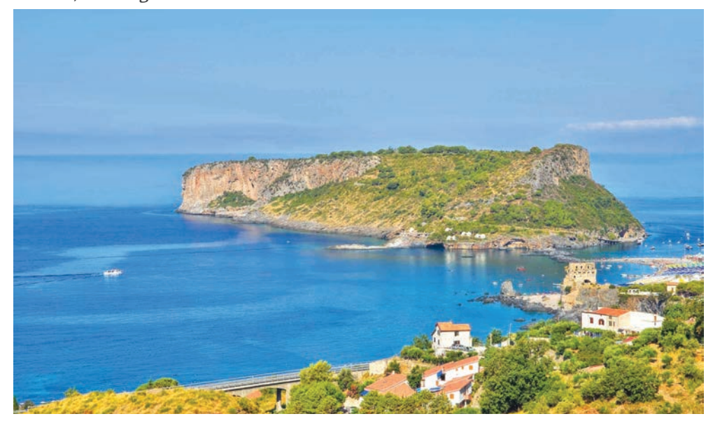
Isola di Dino

Around the island are some archaeological finds dating back to the Greco-Roman period. The seabed of the east side of the island is rich in marine vegetation (Posidonia Oceanica), and there are also specimens of Pinna Nobilis, the largest clam in the Mediterranean.