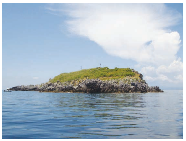
Isola Santo Janni

(Aka Santo Ianni) is an island in Basilicata located in the Gulf of Policastro northwest of Marina di Maratea. The island of Santo Janni is 200 meters long, and at the point of maximum width reaches 80 meters. The highest rocky outcrop measures 18 meters above sea level. The islet owes its name to an ancient chapel dedicated to St. John, located near its highest rocky outcrop. The island of Santo Janni, together with the