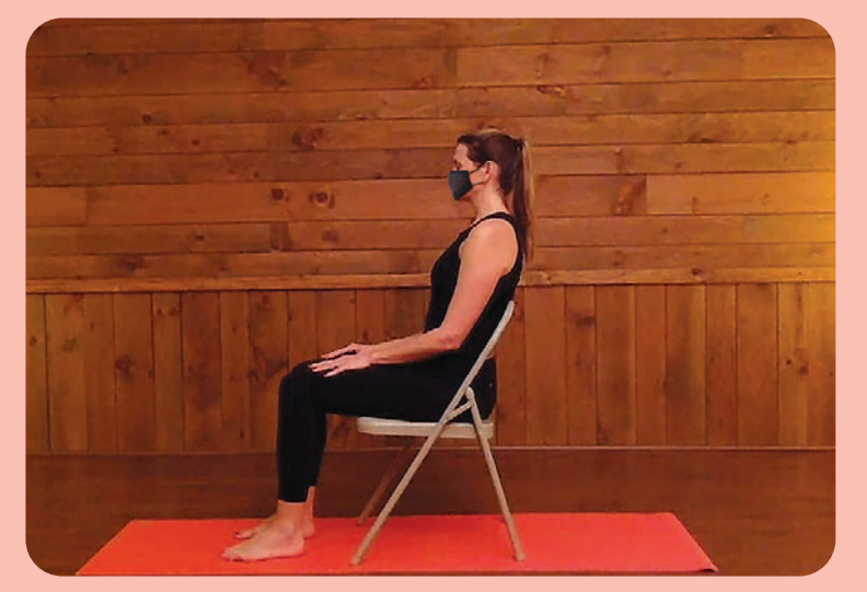
Chair Yoga is a gentle form of yoga that is practiced sitting in a chair or standing using the chair for support. Remember to wear loose comfortable clothing!

This course is great for people wanting to reclaim healthy movement, build strength and joint mobility, and regain your best body regardless of your age and fitness level!