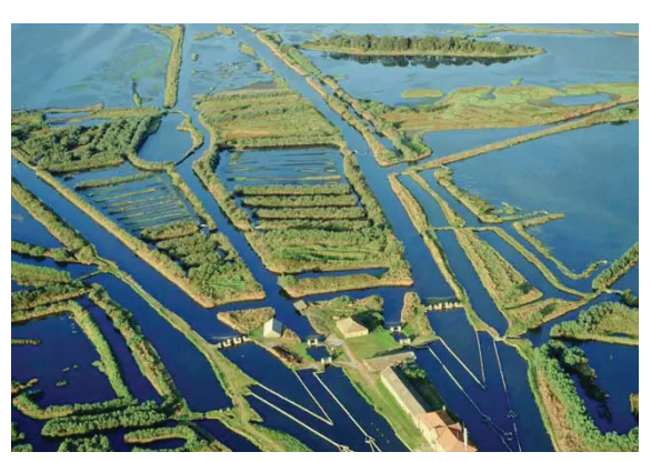
Po Delta Regional Park

Comacchio is not known as Little Venice for any old reason, but because this is a town whose canals' beauty can rival the famous water-based city to the north. For many centuries, Comacchio was a flourishing port city that rivaled Venice for power and influence in the region. Ultimately though, Venice became the maritime power, and Comacchio fell into relative obscurity in comparison. For thousands of years, the economy was based on fishing and the salt trade, which has given way to remarkable tourist development. Comacchio's beaches, these 7 Lidos or seaside resorts, are set away from the town and the canals and offer a pleasant escape along the coast. The more than 20 km of fine golden sand combined with a tranquil and shallow sea have earned top Blue Flag beach designations for years, making this the ideal destination for family holidays.