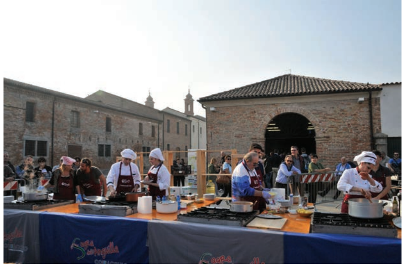
Comacchio Eel Festival

century; the bridge was designed not just as a crossing but also as a defensive structure. This bridge consists of five elegant staircases built at the confluence of five canals and surmounted by two small towers; the bridge allowed for the waters of the internal channels to flow into the sea and, at the same time, it constituted a defense gate at the main entrance to the town. For many centuries it served as a significant deterrent to pirates and would-be invaders looking to pillage Comacchio's wealth. On the square opposite Trepponti is the Pescheria, which dates to the 17th century, and is still a huge fish market. The Palazzo Bellini is another of