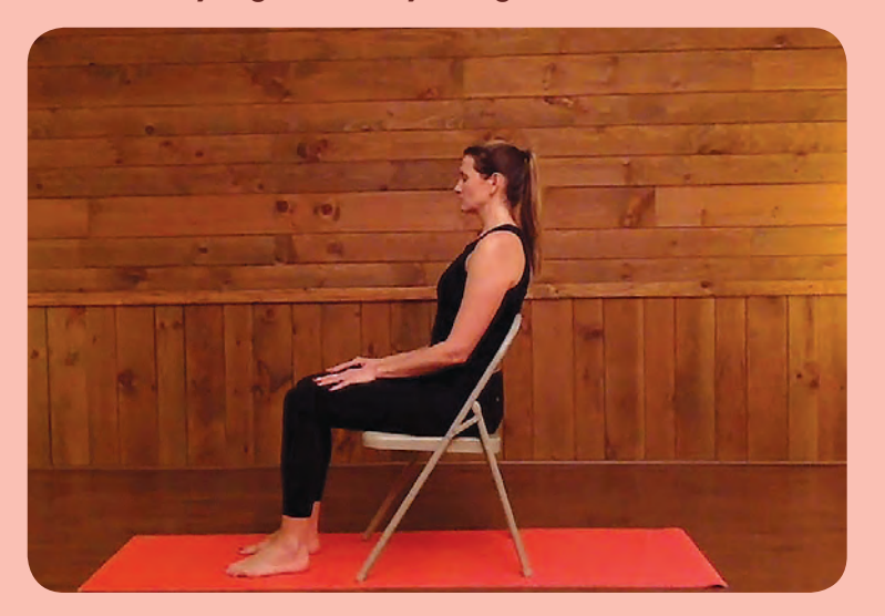
Chair Yoga is a gentle form of yoga that is practiced sitting in a chair or standing using the chair for support. Remember to wear loose comfortable clothing!

This course is great for people wanting to reclaim healthy movement, build strength and joint mobility, and regain your best body regardless of your age and fitness level!