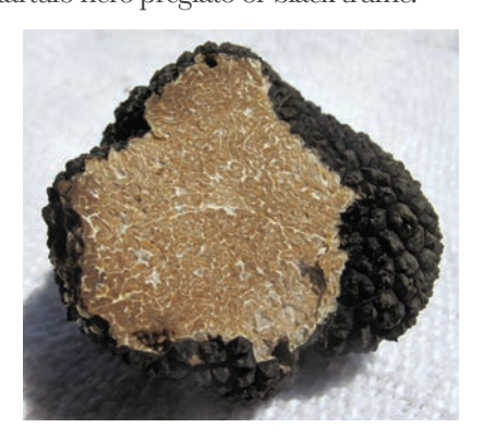
Le Marche "White" Truffles

Truffles are, weight for weight, one of the most expensive foods on the planet. In Le Marche, Acqualagna and Sant'Angelo in Vado are the places to go during truffle season. Italian truffle hunters dig up around 100 metric tons, involving sixteen species of truffles, in Marche a year. Le Marche is home to the most famous and expensive truffle, the tartufo bianco or white truffle (£1,500 a kilo) and the more modestly priced tartufo nero pregiato or black truffle.