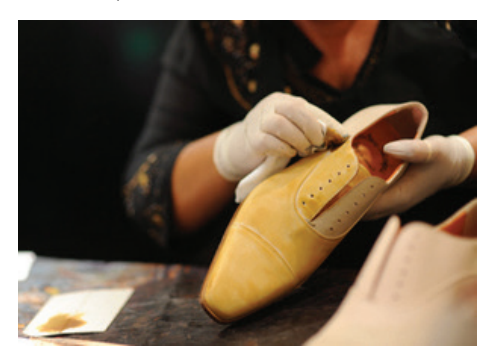
Master Shoemakers of Le Marche