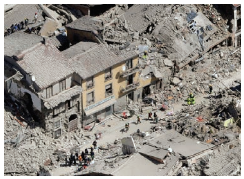
The Marche area was devastated by the August 24th, 2016 central Italy earthquake and is still undergoing intense infrastructure rehabilitation.

by which the 7 municipalities of Montefeltro were annexed from the Province of Pesaro and Urbino to join the Province of Rimini (Emilia-Romagna).