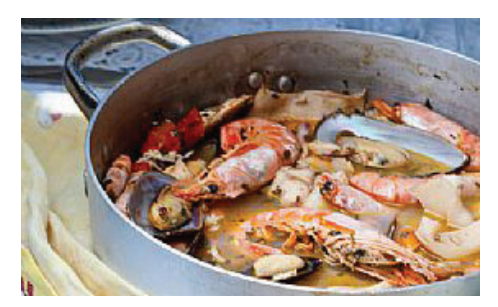
Brodetto Fish Stew

As a region on the Adriatic coast, it is common to find typical seafood dishes. The undisputed champion of these is brodetto, a fish soup containing more than 14 fish varieties; often seasoned with vinegar, garlic or saffron and thickened with flour. Several other seafood combinations are also very popular. Potacchio includes white wine, tomato, onion and rosemary with lemon juice. Mussels are stuffed with ham, breadcrumbs and parsley before roasting in tomato sauce to make muscioli arrosto. Dried cod, tomatoes and carrots are Brodetto Fish Stew cooked in a garlic and rosemary flavored sauce made with olive oil, white wine, and milk for stocco all'anconetana. Soups popular in Marche cuisine include minestra di trippa, a tripe soup served with battuto, an herb flavored pork fat.