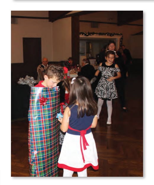
SIAMO QUI | P. 7 JANUARY 2019