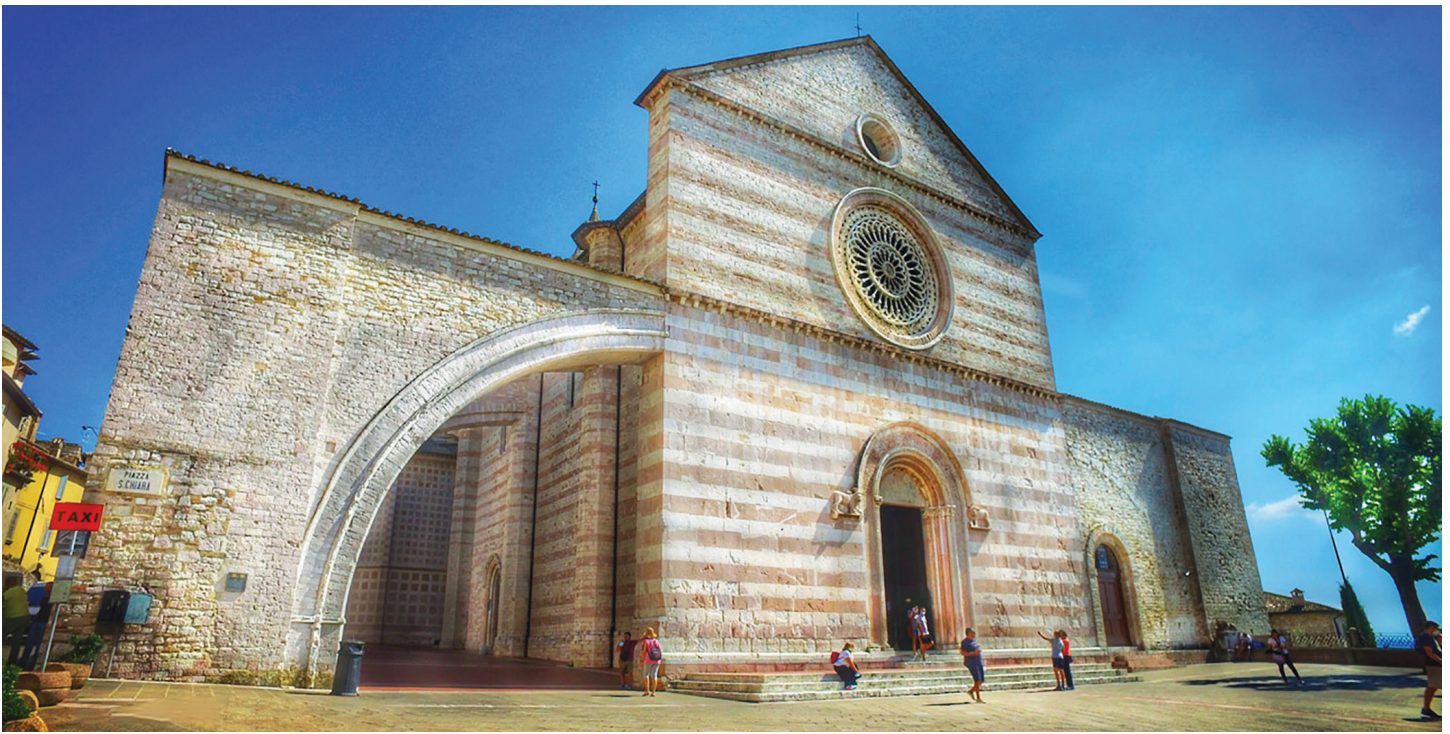
Basilica of Santa Chiara

Other landmarks in Assisi's center include the Church of San Pietro, Santa Maria Maggiore, the Renaissance fort of Rocca Maggiore, and the Carceri Hermitage, a series of caves where Saint Francis and his companions once lived. The chapel of Santo Stefano, the oldest house of worship in Assisi, is also part of this UNESCO site.