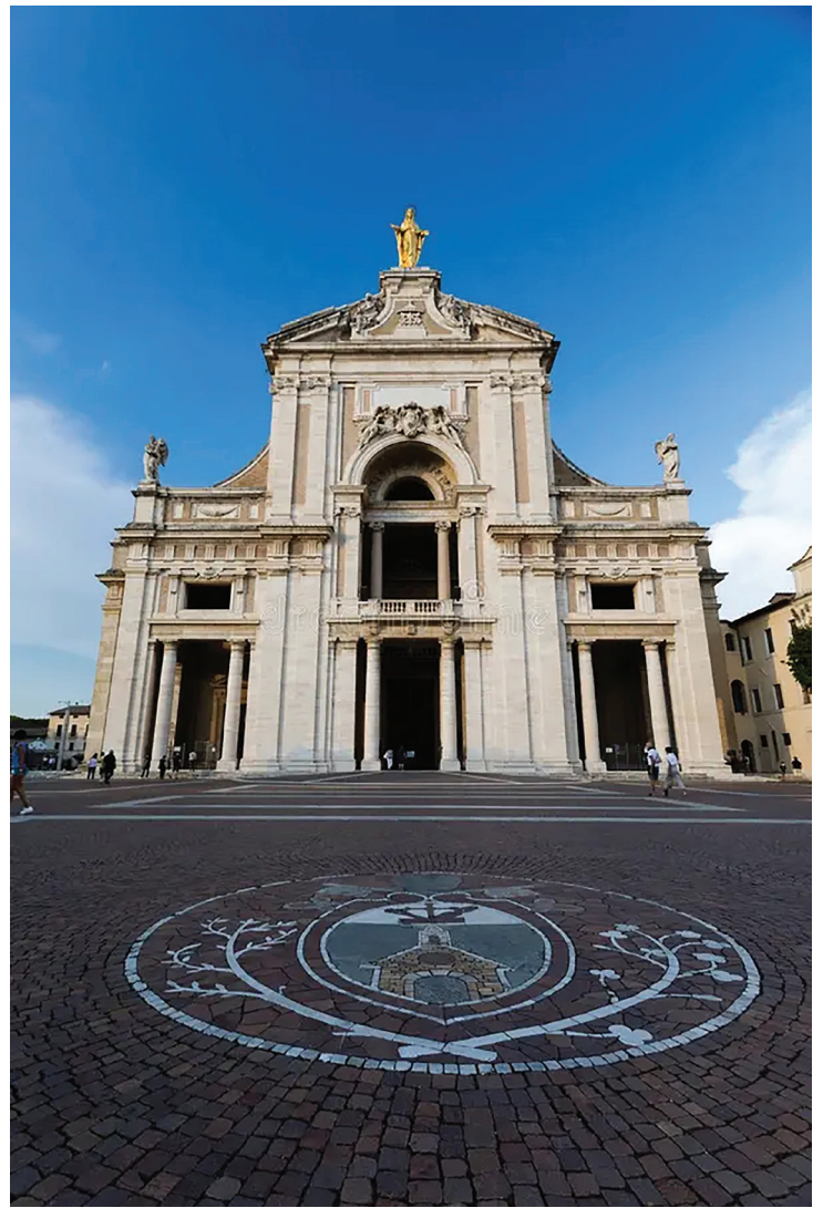
Basilica of Santa Maria degli Angeli

In addition to the Basilica of San Francesco, Assisi boasts other significant Franciscan sites, such as the 14th-century Basilica of Santa Chiara, where the tomb of Saint Clare, a devoted companion and disciple of Saint Francis, is located, and the Basilica of Santa Maria degli Angeli.