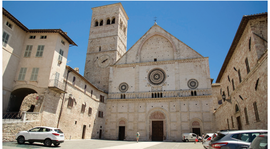
Cathedral of San Rufino

The iconic landmarks of Assisi are a testament to the enduring legacy of the Franciscan order in the region and offer visitors a unique insight into the history and culture of the town. The Franciscan message of love, compassion, and humility has had a lasting influence on the town of Assisi and its people and continues to attract followers worldwide. The town's rich history and cultural significance, along with its beautiful natural surroundings, make it a must-visit destination for anyone interested in the history and culture of central Italy. □