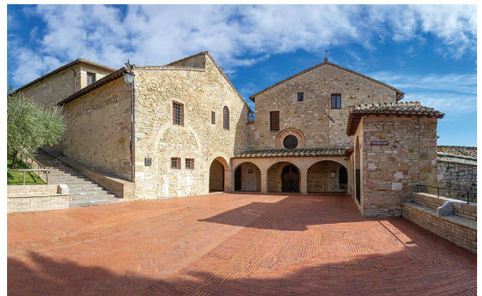
San Damiano Training Monastery