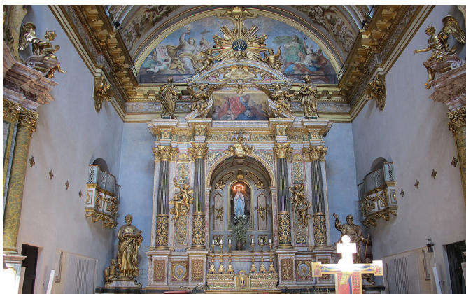
St Maria Sopra Minerva Basilica