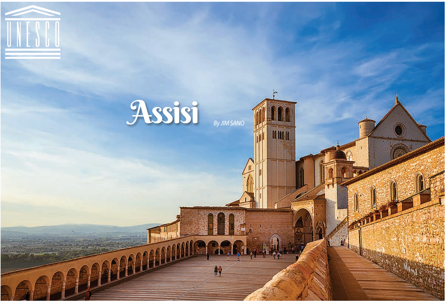
Basilica of San Francesco

A ssisi is a charming small town in the Umbria region of central Italy. It is famous for being Saint Francis and Saint Clare's birthplace and has a rich history as a center for religious and spiritual activities that date back to Roman times. Frequent conquests and sieges from conflicts between the Germanic and Byzantine peoples marred Assisi's medieval history. This turbulent era led to the construction of numerous castles in the area, including Rocca Maggiore. It is conceivable that the violence and turmoil during this period influenced Saint Francis' yearning for peace in his hometown and his mission to propagate a message of worldwide peace.