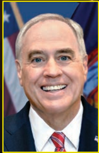
HONORABLE THOMAS DINAPOLI New York State Comptroller Italian American of the Year