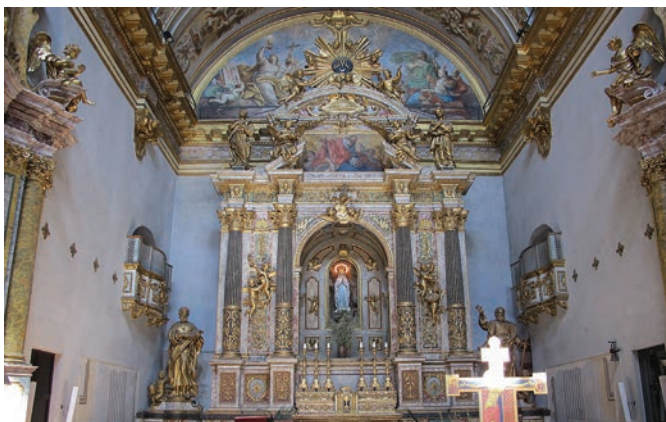
St Maria Sopra Minerva Basilica