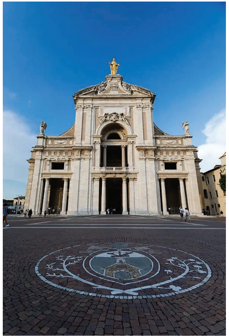
Basilica of Santa Maria degli Angeli

In addition to the Basilica of San Francesco, Assisi boasts other significant Franciscan sites, such as the 14th-century Basilica of Santa Chiara, where the tomb of Saint Clare, a devoted companion and disciple of Saint Francis, is located, and the Basilica of Santa Maria degli Angeli.