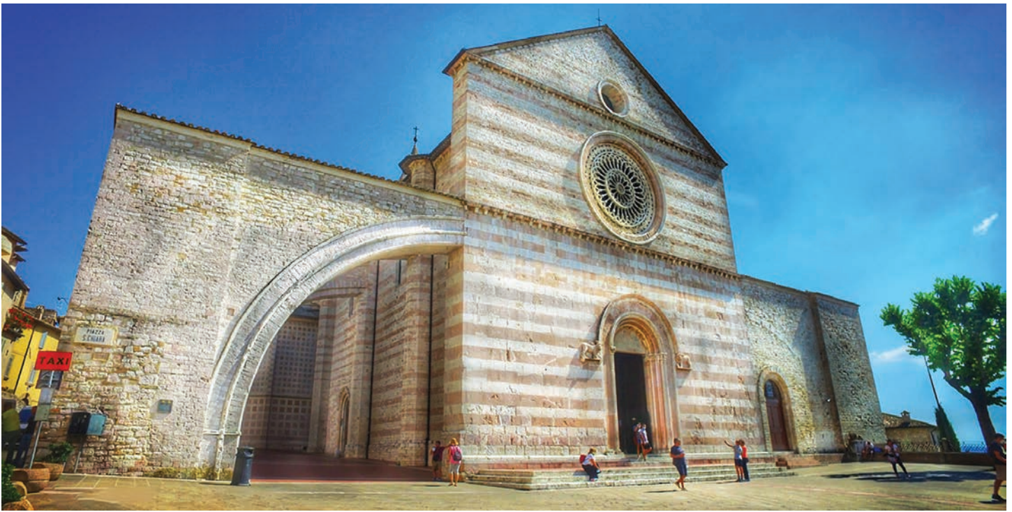
Basilica of Santa Chiara

Other landmarks in Assisi's center include the Church of San Pietro, Santa Maria Maggiore, the Renaissance fort of Rocca Maggiore, and the Carceri Hermitage, a series of caves where Saint Francis and his companions once lived. The chapel of Santo Stefano, the oldest house of worship in Assisi, is also part of this UNESCO site.