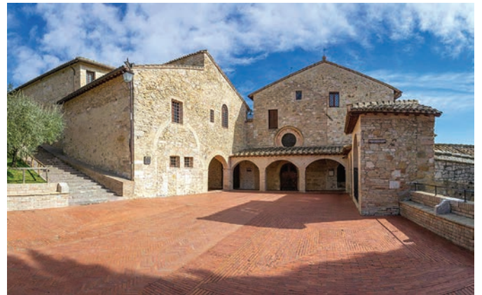
San Damiano Training Monastery