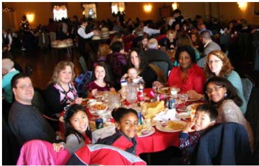
Enjoying a wonderful dinner by Mallozzi's