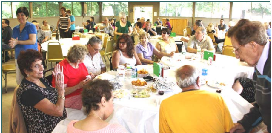
Members & Non-members enjoying the evening together