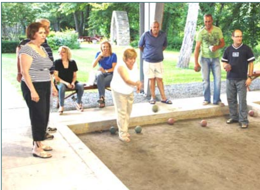
A fun game of bocce with family and friends