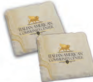
IACC CHISELED COASTERS