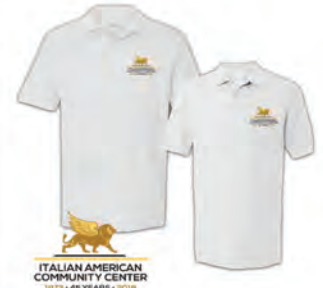
IACC PIQUE POLO