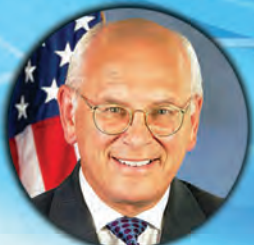
Hon. Paul Tonko Italian Spirit Award