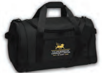
IACC DUFFEL BAG