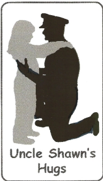
Uncle Shawn's Hugs