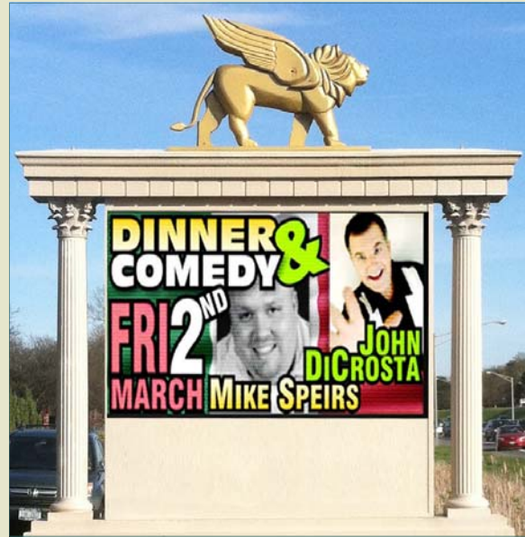
New Color LED Sign

In the past several years, like gas, the cost of advertising has continued to increase, making it virtually impossible to run effective advertising campaigns for membership or events. Competition has also increased. Where do people spend their time? How do they want to network and socialize? It is not the same as it was in 1973, when the club broke ground.