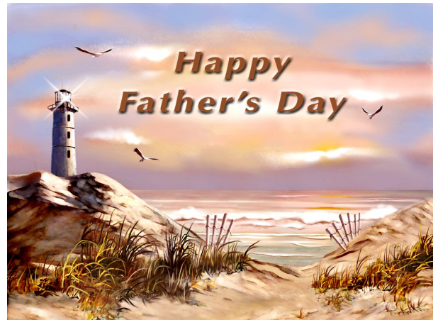
Art by Vic Consiglio