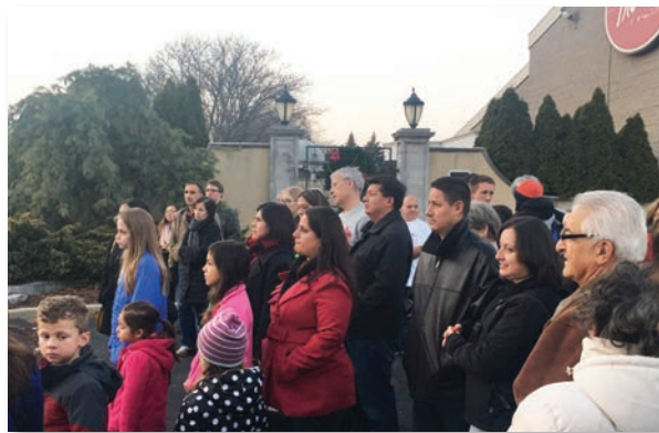
Part of the overflow crowd that attended our new tradition of the lighting of our a newly planted Christmas tree. This tree will be a symbol that will wish the I.A.C.C. members and visitors alike, a Buona Natale for many years to come.