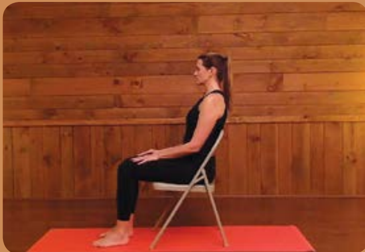
Chair Yoga is a gentle form of yoga that is practiced sitting in a chair or standing using the chair for support. Remember to wear loose comfortable clothing!

The price will be $40.00 for the session or $8.00 a class to "drop-in."