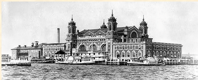
Ellis Island Immigration Center, 1905

Records of immigrants to Castle Garden/Barge Office have been transcribed onto standardized forms that can be accessed from the Steven Morse site, or by using the Search button at the free site http://www.castlegarden.org . Enter as many of the following that are known: ship, departure port, first name, last name, occupation, country, place of last residence, and date. The site will return a list of possibilities. Selecting one from