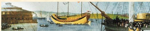
Ships arriving at Castle Garden

same format and details as described for Ellis Island manifests, for the years that it was open. Even when you know your ancestors arrived at a