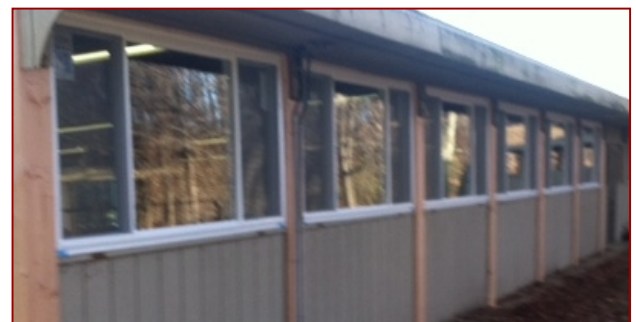
From the thruway side