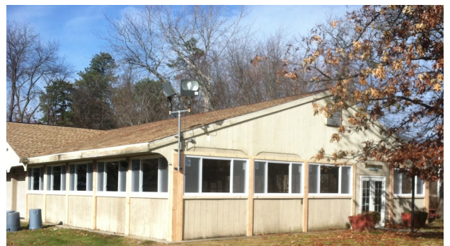
From the pool side