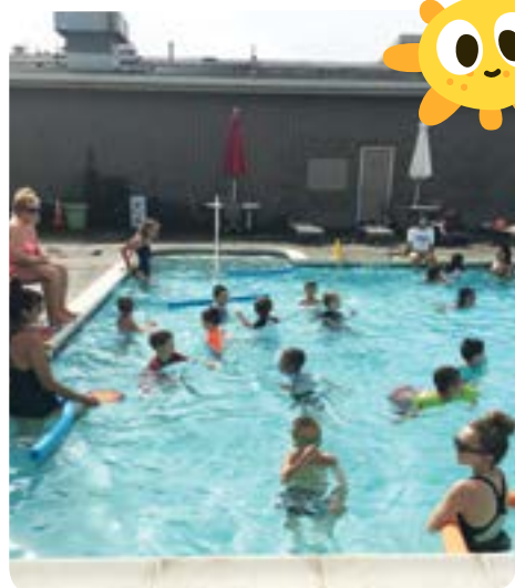
School children from nearby Pineview School enjoy the pool as part of their regular summer camp program.