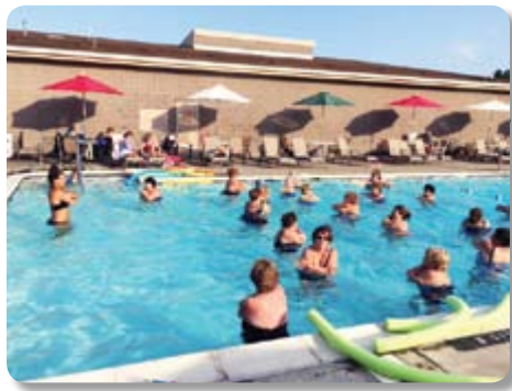
WATER AEROBICS & OTHER WOMEN'S LEAGUE EVENTS.