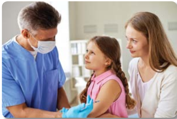
FLU, PNEUMONIA & SHINGLES CLINIC!