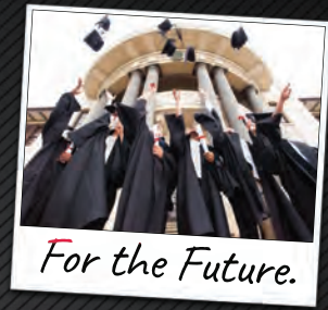
For the Future.