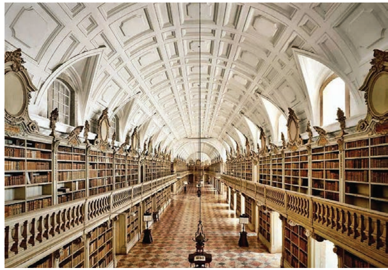
Vatican Apostolic Library

The Vatican Apostolic Library contains a priceless collection of 150,000 manuscripts and 1.6 million printed books, many from pre-Christian and early Christian times. It derives its income from the voluntary contributions of more than one billion Roman Catholics worldwide and interest on investments and the sale of stamps, coins, and publications. The Vatican publishes its own influential daily newspaper, L'Osservatore Romano . Its press can print Vatican Library books and pamphlets in 30 languages, from old Ecclesiastical Georgian to Indian Tamil.