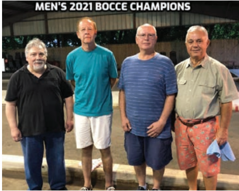
MEN'S 2021 BOCCHE CHAMPIONS