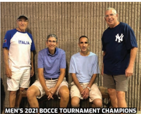
MEN'S 2021 BOCCHE TOURNAMENT CHAMPIONS