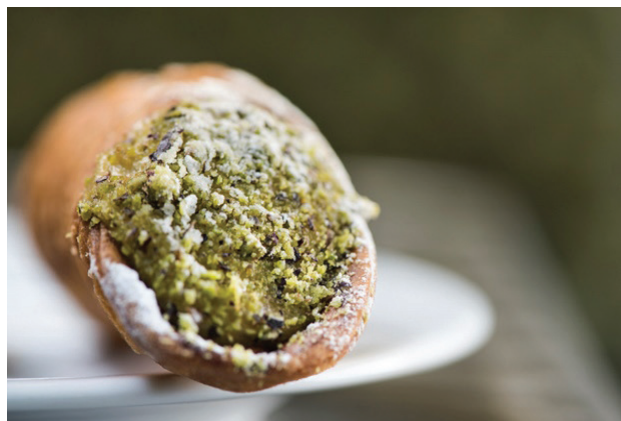
Cannoli filled with pistachio cream

out of the bag. Some prefer to lightly toast them in a pan to release their essential oils and intensify their flavor and toss them into salads or use them in a unique pesto sauce. They are used in the confectionary industry for cakes, pastries, torrone, mousses, confections, and ice creams. They are also used in meat stuffing inside arancini, Sicilian stuffed rice balls, and even in the cosmetics industry.