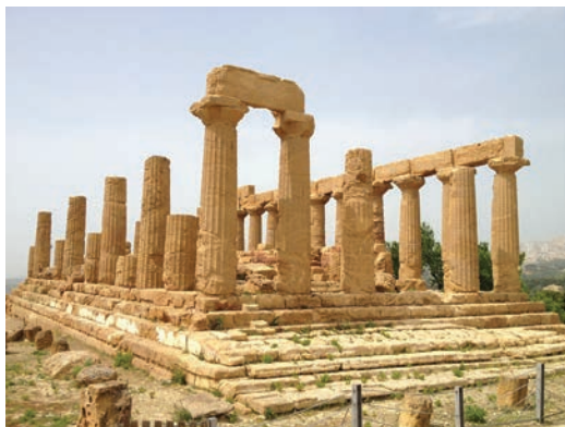
Valley of the Temples, Agrigento

Sicily boasts 7 Unesco World Heritage sites but for many that is just the beginning. Let's start with Agrigento and The Valley of Temples. Founded in the 6th century B.C., the ancient city of Agrigento was one of the greatest Mediterranean centers. The remains of the Doric Temples which dominate the city are well preserved and are one of the most terrific monuments of Greek art and culture. Villa Romana del Casale is located in Contrada Casale, at the foot of Mont Mangone. The exceptional beauty and quality of the mosaics which decorate the villa illustrate the greatness and underline the importance of the Villa.