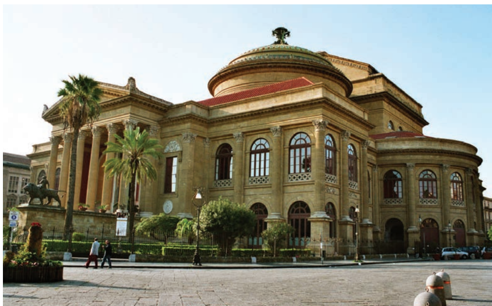
Teatro Massimo Vittorio Emanuele

Sicily has a rich and unique culture, especially regarding the arts, music, literature, cuisine, and architecture. Many poets, writers, philosophers, intellectuals, architects and painters have roots on the island. This can be traced back to the Greek philosopher Archimedes, a Syracuse native who became renowned as one of the greatest mathematicians of all time.