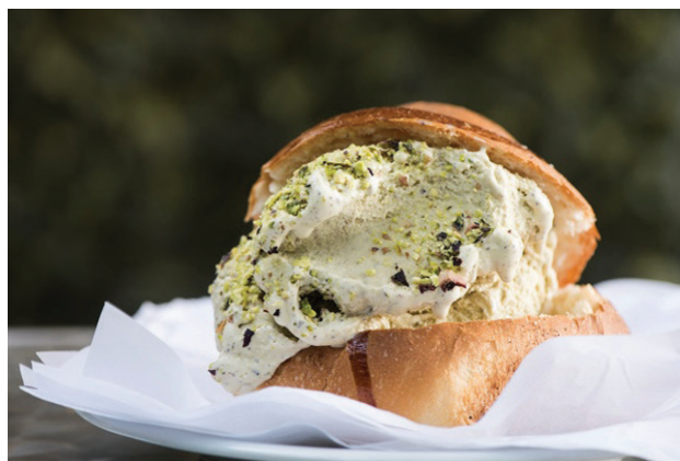
'Gelato con brioche'

These iridescent gems are engrained in the history and culture of Sicily and it doesn't take long to realize that pistachios are infused in the very fiber of Sicilian culture and cuisine. To this point, the Bronte pistachio obtained European Union P.D.O.(Protected Designation of Origin) certification in 2009. The P.D.O. Label establishes the rules and regulations regarding the exact area of cultivation (i.e. the Sicilian Commune of Bronte), and production, harvesting and labeling practices thus protecting not only the product but the consumer too. To make sure you're getting the real deal, look for the D.O.P. label and be prepared to spend around $4 to $5 an ounce. They're not called "Green Gold" for nothing!