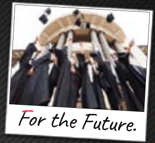
For the Future.