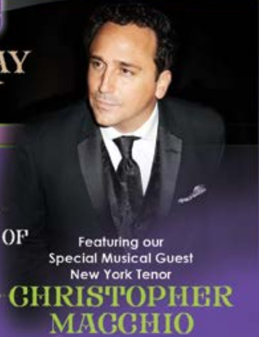
Featuring our Special Musical Guest New York Tenor