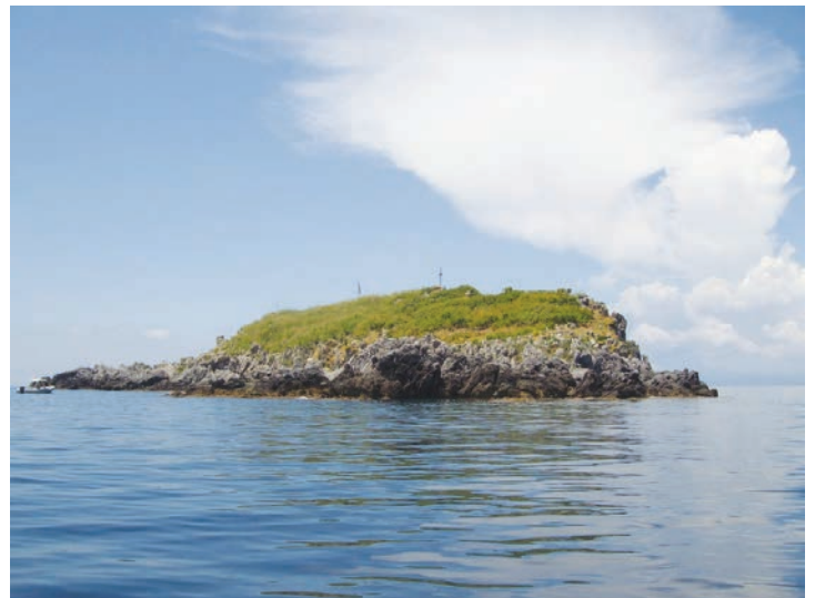
Isola Santo Janni

(Aka Santo Ianni) is an island in Basilicata located in the Gulf of Policastro northwest of Marina di Maratea. The island of Santo Janni is 200 meters long, and at the point of maximum width reaches 80 meters. The highest rocky outcrop measures 18 meters above sea level. The islet owes its name to an ancient chapel dedicated to St. John, located near its highest rocky outcrop. The island of Santo Janni, together with the