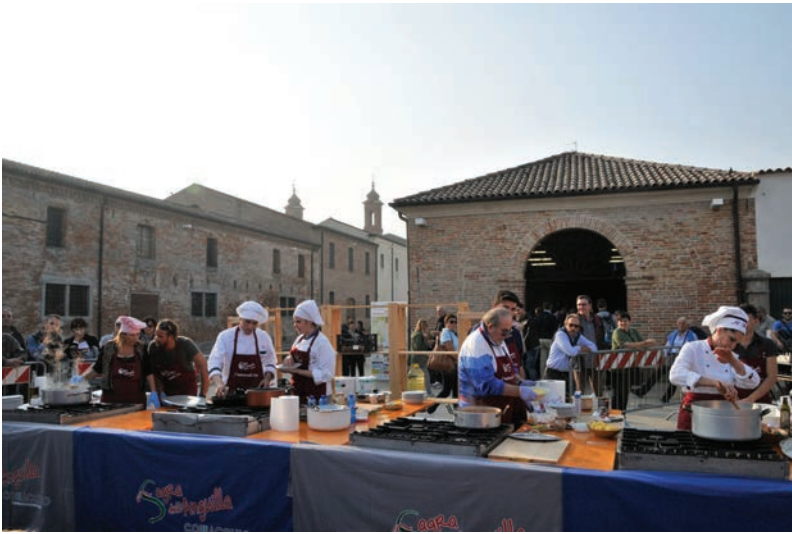
Comacchio Eel Festival

century; the bridge was designed not just as a crossing but also as a defensive structure. This bridge consists of five elegant staircases built at the confluence of five canals and surmounted by two small towers; the bridge allowed for the waters of the internal channels to flow into the sea and, at the same time, it constituted a defense gate at the main entrance to the town. For many centuries it served as a significant deterrent to pirates and would-be invaders looking to pillage Comacchio's wealth. On the square opposite Trepponti is the Pescheria , which dates to the 17th century, and is still a huge fish market. The Palazzo Bellini is another of