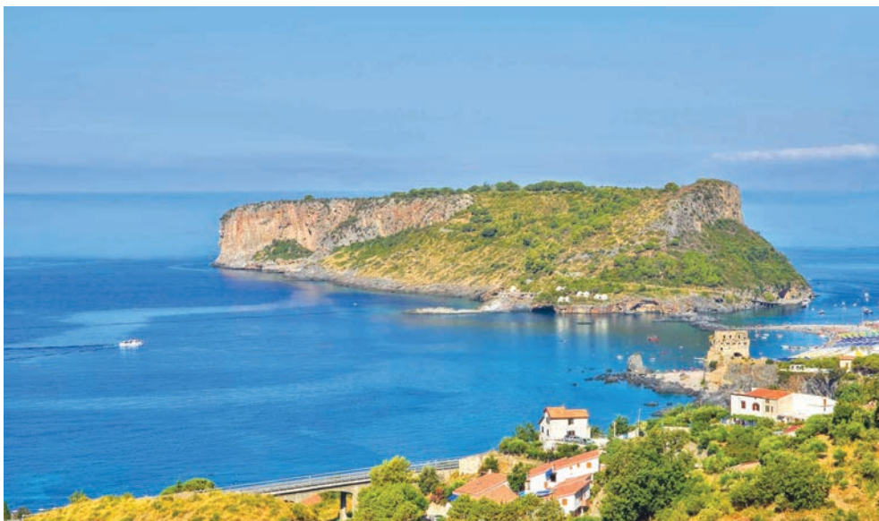
Isola di Dino

In 1928, the island became the autonomous property of the municipality of Praia a Mare. In 1956, the island was given a concession for 99 years, and in