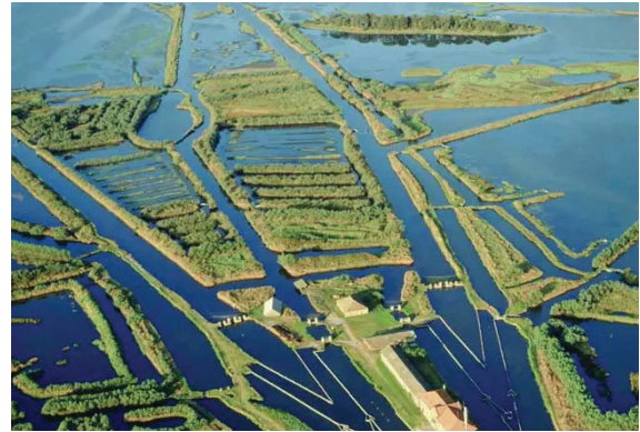
Po Delta Regional Park

Comacchio is not known as Little Venice for any old reason, but because this is a town whose canals' beauty can rival the famous water-based city to the north. For many centuries, Comacchio was a flourishing port city that rivaled Venice for power and influence in the region. Ultimately though, Venice became the maritime power, and Comacchio fell into relative obscurity in comparison. For thousands of years, the economy was based on fishing and the salt trade, which has given way to remarkable tourist development. Comacchio's beaches, these 7 Lidos or seaside resorts, are set away from the town and the canals and offer a pleasant escape along the coast. The more than 20 km of fine golden sand combined with a tranquil and shallow sea have earned top Blue Flag beach designations for years, making this the ideal destination for family holidays.