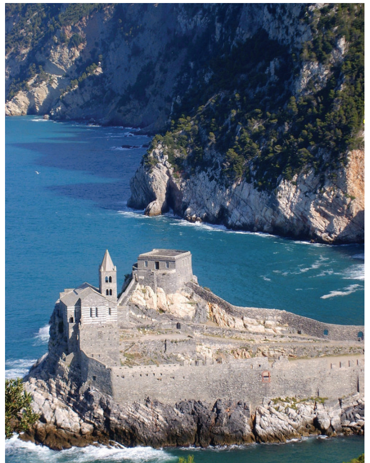
Island of Palmaria

Palmaria Island takes its name from the term "Balma," meaning cave. The island offers many