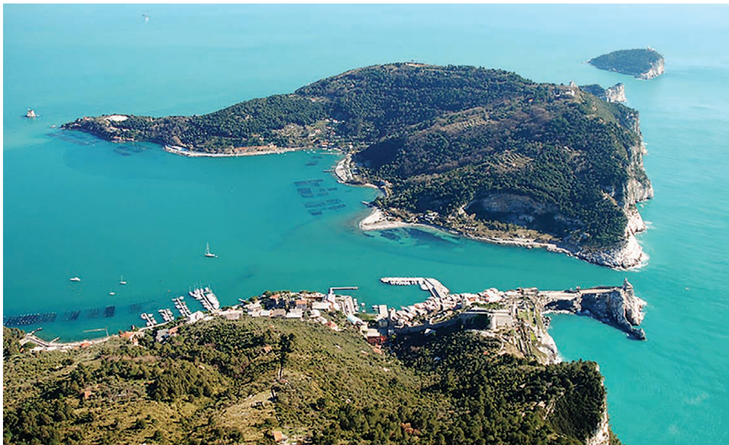
Island of Palmaria

The island has a handful of houses and even a restaurant, with little human habitation. At the top of the island sits a 19th-century Savoy-built military fortification, which has now been refurbished and houses a marine and environmental education center.