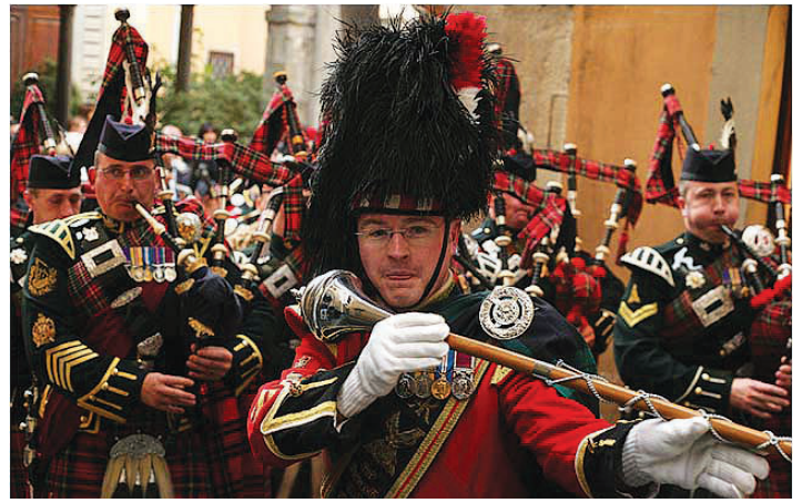
The Royal Scots Borderers in Barga