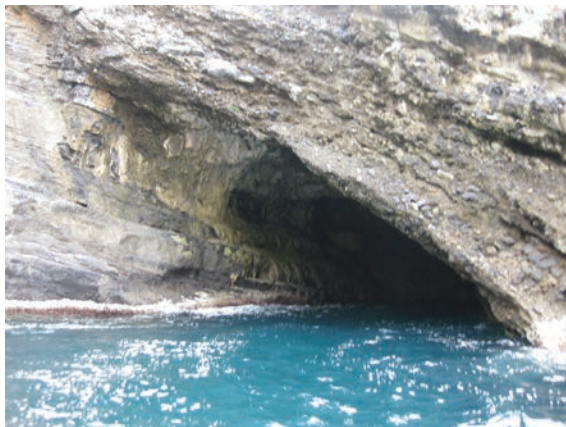
Blue Cave and Marble Caves