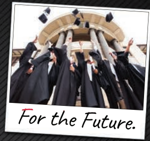
For the Future.