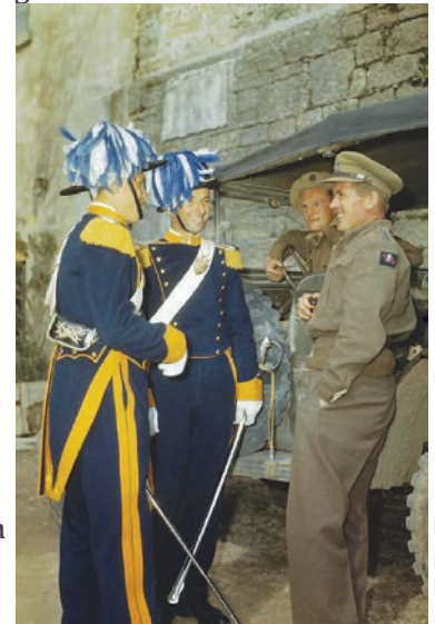
Captains Regent Welcome British Troops

During World War II, even though its neutrality was recognized, it was bombed by the Royal Air Force in June of 1944, believing that San Marino had been overrun by German forces and was being used to amass stores and ammunition. The Sammarinese government again declared its neutrality. During World War II, San Marino took in more than 100,000 Italian refugees as the war reached Italy's surrounding areas. In September 1944, for only the second time in its history, German forces briefly occupied San Marino. They were defeated by Allied troops in the Battle of San Marino.