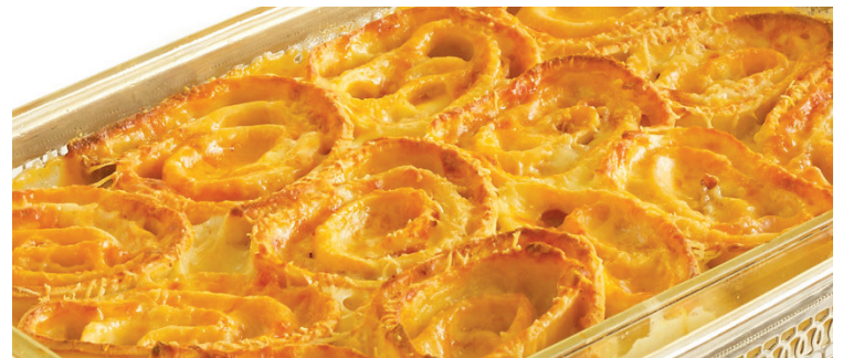
Nidi di Rondine

has its own league, but of the three, soccer is by far the most popular. They also are passionate about Formula One racing. There used to be a San Marino Grand Prix that was held in Imola, Italy. In 2007, the government halted the race after the legendary racers Ayrton Senna and Roland Ratzenberger's deaths. Despite living on a mountain slope, the Sammarinese take pride in their healthy foods and long-life span. On average, the Sammarinese, who have lived their lives in San Marino, have an average life span of 80. Tourism is most important to San Marino's GDP. They welcome about 2 million visitors each year to their tiny republic.