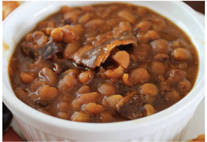
Fagioli con le cotiche

The people of San Marino speak Italian and Sammarinese (dialect). They take great pride in their heritage and roots, which can be traced back to ancient Rome. Everything in San Marino has Italian features, from food to fashion sense. Over 95% of Sammarinese go to Catholic churches and celebrate Catholic customs and traditions. The Sammarinese also love their sports, especially soccer, basketball, and volleyball. Each of these sports