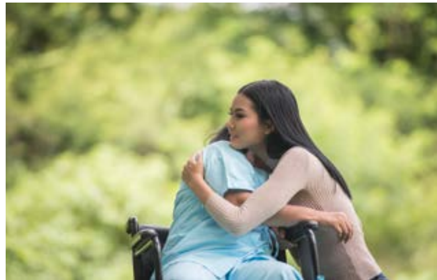
This page photo: Designed by jcomp / Freepik; Opposite page: Mother-daughter photo: Designed by Beartides / Freepik; - Background: Designed by Freepik.