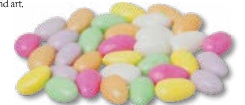
Continues on Pg. 12

Perhaps one of the most colorful and aesthetically beautiful almond desserts is Italian Confetti (Jordan Almonds), a traditional offering of the city of Sulmona. It was in Abruzzo where confetti were first invented in Sulmona. In the 15th century, the nuns at Santa Chiara monastery wrapped pieces of almond candy in silk and gave it in homage to noble brides, bishops and royalty. Ordinary people's only chance to taste the sweet was during the Ferragosto processions when the magistrate threw confetti to the crowds. The almonds are peeled and coated in sugar and come in virtually every color of the rainbow. While this dessert can be served loose in a bowl, both the eyes and taste buds delight at confetti that is fashioned into gorgeous bright flower bouquets and other aesthetically pleasing designs. Sulmona is home to this exquisite combination of food and art.