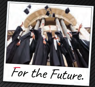
For the Future.