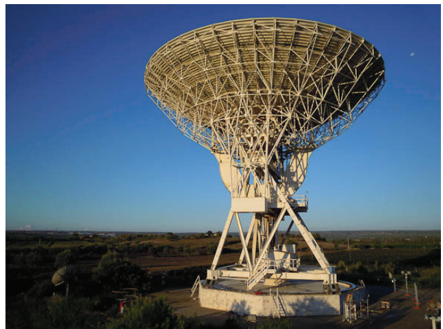
Parabolic Antenna of Noto

Syracuse is also an experimental center for the solar technologies through the creation of the project Archimede solar power plant that is the first concentrated solar power plant to use molten salt for heat transfer and storage which is integrated with a combined-cycle gas facility.