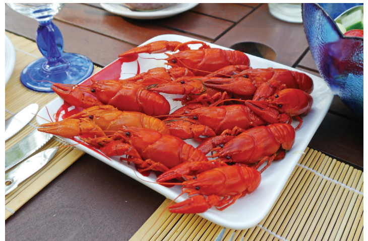
Gambero Rosso & sicilian sardines

Sicily is renowned for its seafood. Sicily is famous for its sardines and Gambero Rosso (red prawns) with big, fat specimens caught off its shores every day. The red prawns from Mazara del Vallo on the western coast of the island are regarded as the best in the world. When they're at their freshest, they are simply dressed in a little local lemon juice and olive oil and eaten raw. Sardines are prepared in all sorts of ways, but one of the most popular is a beccafico , which sees them stuffed with pine nuts, raisins and breadcrumbs before being baked. Involtini di pesce spada , baked swordfish rolls, are also very popular. Thin slices of swordfish are topped with capers, pine nuts, raisins, olives and lemon, then rolled into a spiral and secured with a skewer. They're then baked, fried or grilled, sometimes with extra breadcrumbs around the outside.