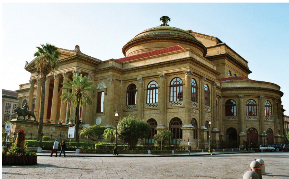
Teatro Massimo Vittorio Emanuele

Sicily has a rich and unique culture, especially regarding the arts, music, literature, cuisine, and architecture. Many poets, writers, philosophers, intellectuals, architects and painters have roots on the island. This can be traced back to the Greek philosopher Archimedes, a Syracuse native who became renowned as one of the greatest mathematicians of all time.