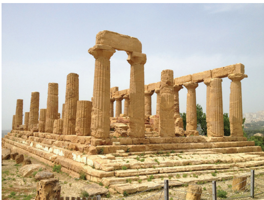
Valley of the Temples, Agrigento

Sicily boasts 7 Unesco World Heritage sites but for many that is just the beginning. Let's start with Agrigento and The Valley of Temples. Founded in the 6th century B.C., the ancient city of Agrigento was one of the greatest Mediterranean centers. The remains of the Doric Temples which dominate the city are well preserved and are one of the most terrific monuments of Greek art and culture. Villa Romana del Casale is located in Contrada Casale, at the foot of Mont Mangone. The exceptional beauty and quality of the mosaics which decorate the villa illustrate the greatness and underline the importance of the Villa.