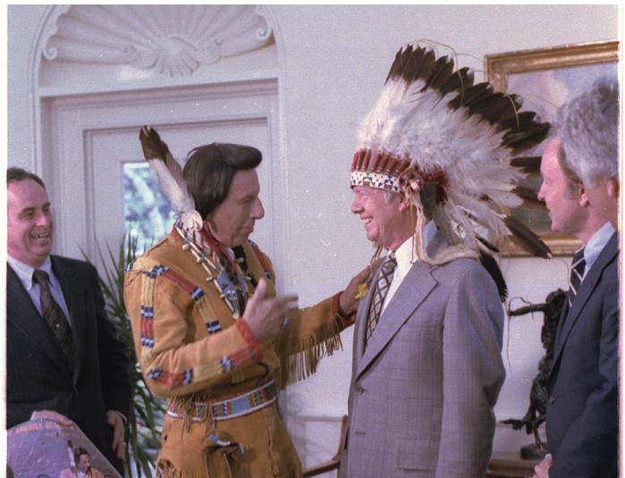
Espera DeCorti (Iron Eyes Cody) & President Jimmy Carter

Famous painters like Antonello da Messina, and Renato Guttuso were born here as well as the famous musician and composer Vincenzo Bellini.