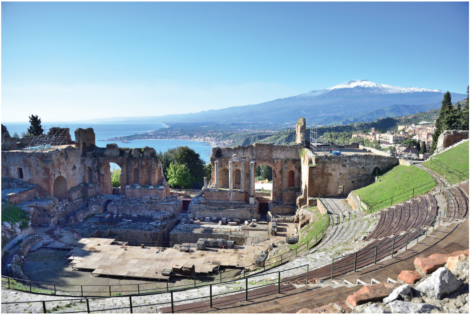
The Greek Theater of Taormina is without question the most important feature for Taormina visitors. Its beautiful natural setting yields a splendid view of the Calabrian coast, the Ionian coast of Sicily and the spectacular cone of Mount Etna.

Terracotta ceramics from the island are well known. The art of ceramics on Sicily goes back to the original ancient people named the Sicanians. It was then perfected during the period of Greek colonization and is still prominent and distinct to this day. Caltagirone is one of the most important centers in Sicily for the artistic production of ceramics and terra-cotta sculptures.